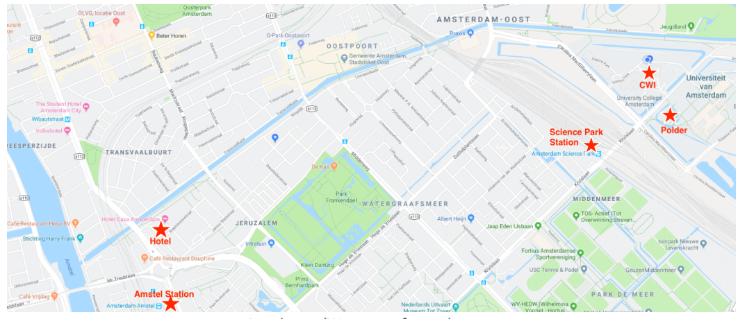
Local area (Watergraafsmeer)

For those staying at the hotel CASA 400, the hotel is very close to Amsterdam Amstel station, from where there are very regular busses to Amsterdam Science Park (the 40 and the 240). For those so inclined, it is also about a 30-minute walk all along the canal (Ringdijk), in easterly direction, away from the Amstel river.