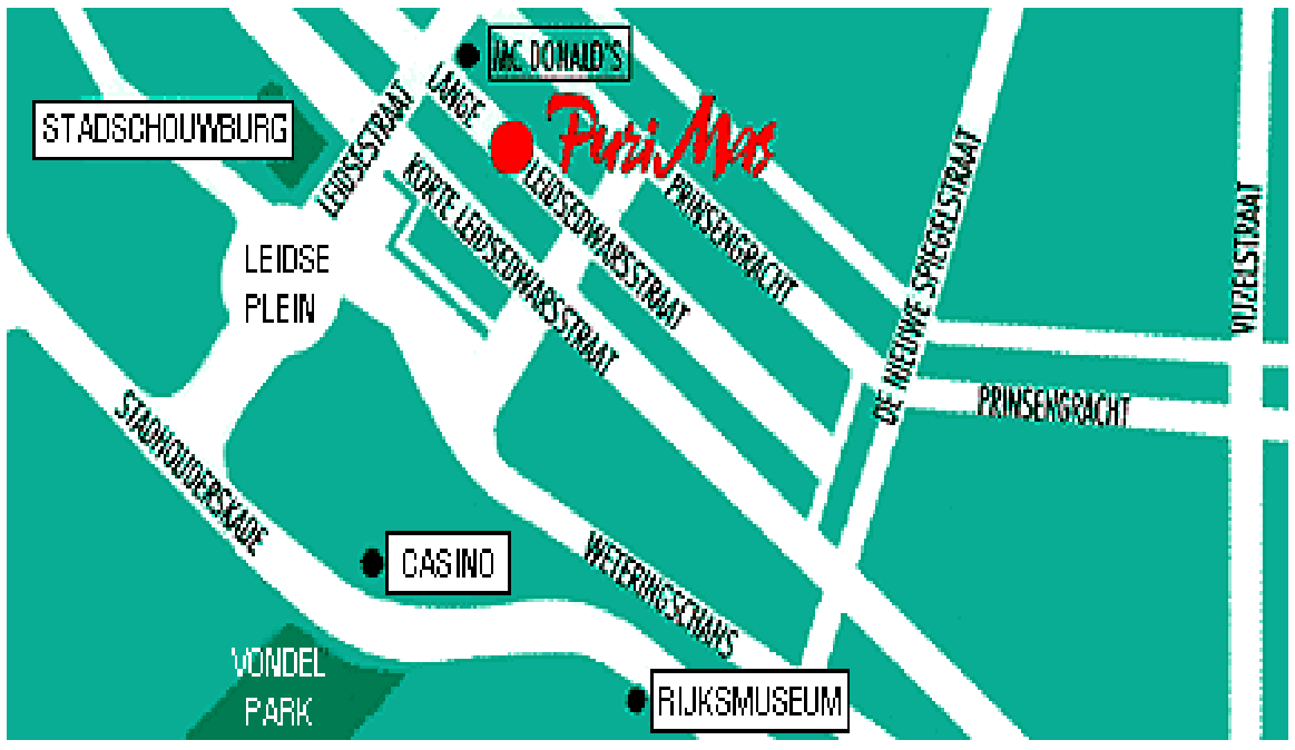
Map 3: Puri Mas