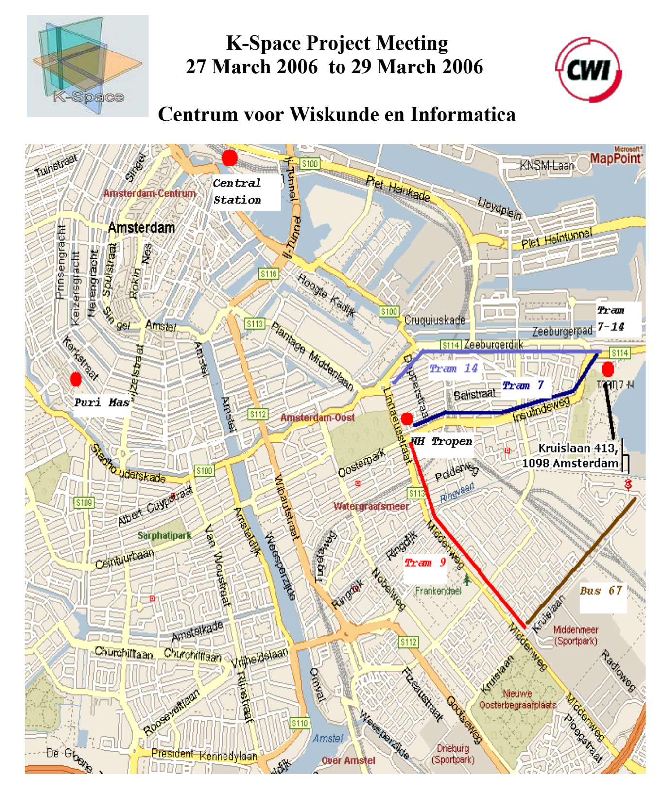
Map 1: Amsterdam