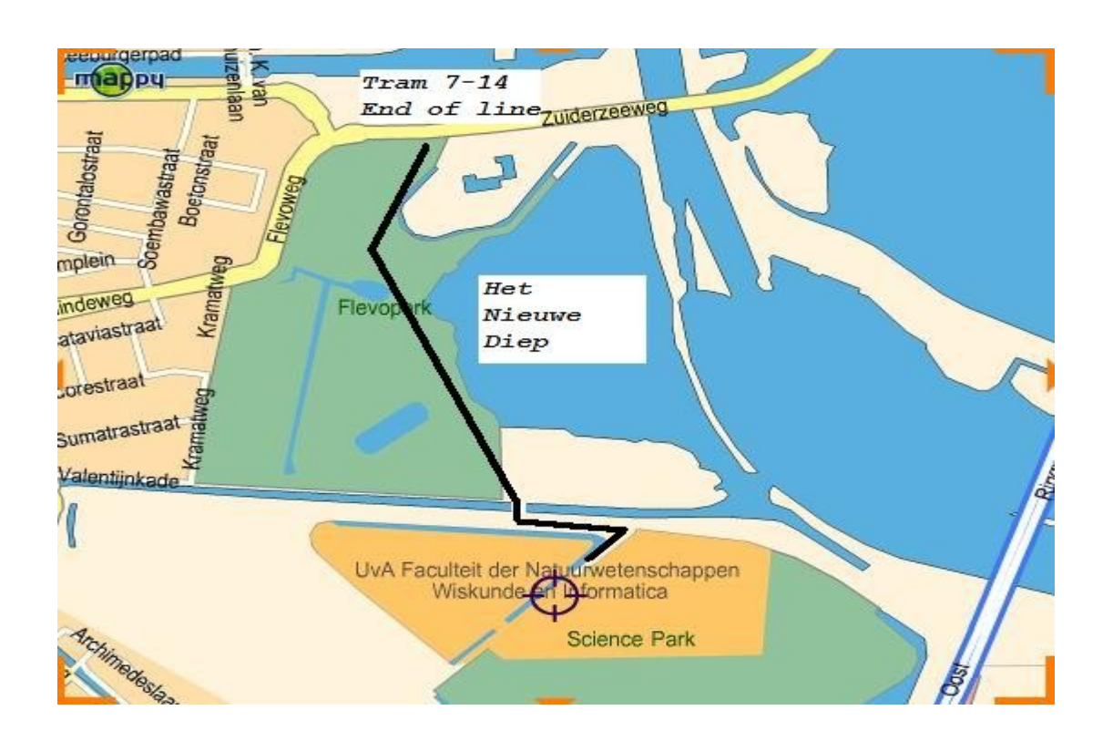
Map 2: FlevoPark