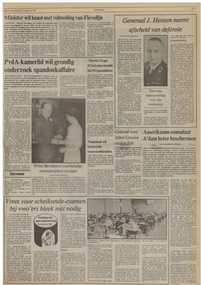
Fig. 4. Screenshot of an example newspaper in original lay-out, containing an article about a parliamentary debate.