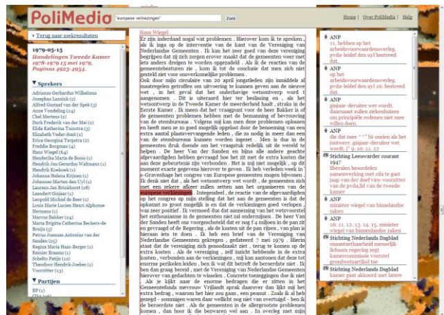
Fig. 3. Screenshot of the PoliMedia debate page