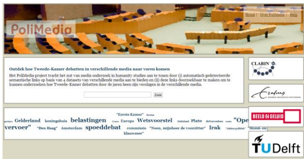
Fig. 1. Screenshot of the PoliMedia home page